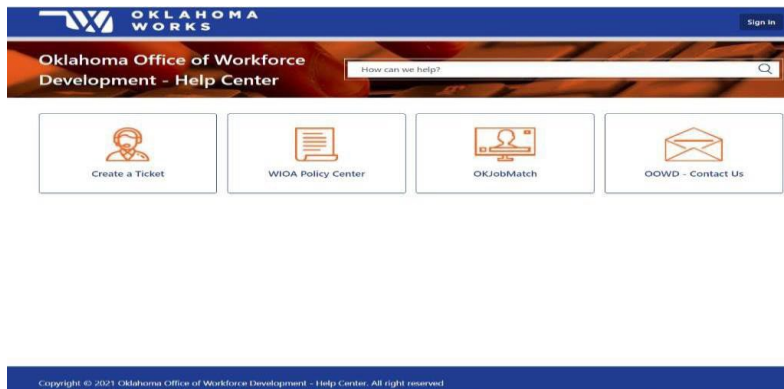
OOWD Helpdesk Screen